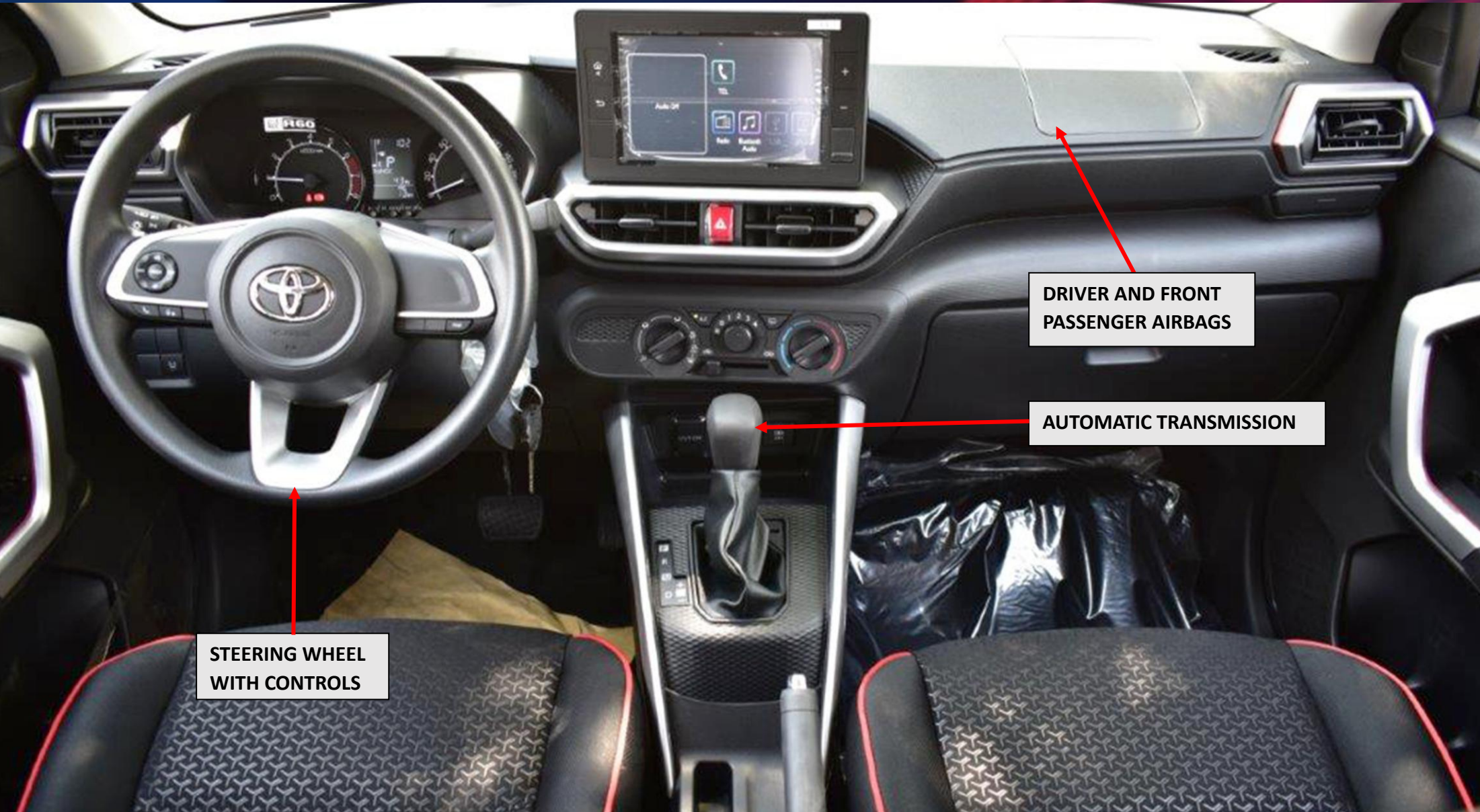
STEERING WHEEL WITH CONTROLS