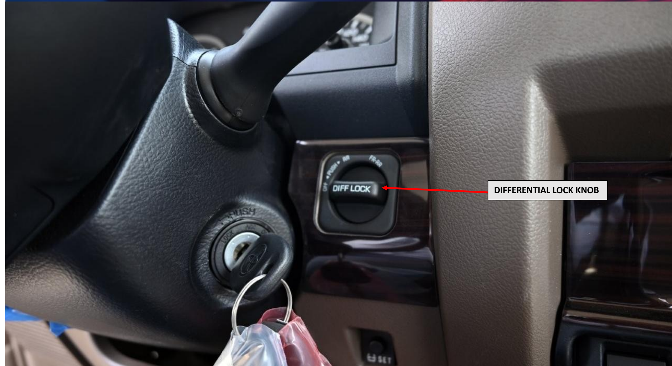
DIFFERENTIAL LOCK KNOB